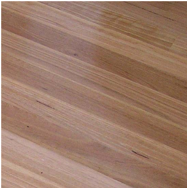
Select Grade - Blackbutt

It is therefore important to realize that the overall colour or blend of colour in a floor is dependent on the species or species mix chosen and that the character of the floor, in terms of the features present, such as gum veins, is determined by the grade. If choosing an alternative species from the one originally considered, not only will the overall colour differ but the predominating type of feature may also change. It is important to work closely with your supplier and installer so that they can be clear about the look that you desire.