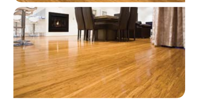
Sizes: 1850mm x 125mm x 14mm