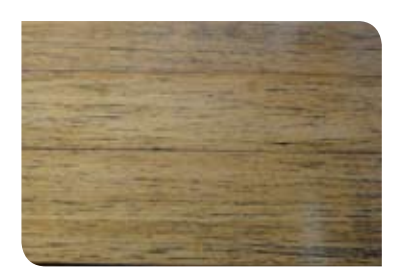
Craftwood Brushed Surface Champagne