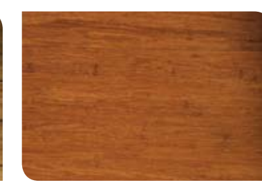
Natural Antique Carbonised